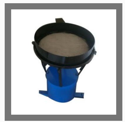
Automatic Vibrator Machine