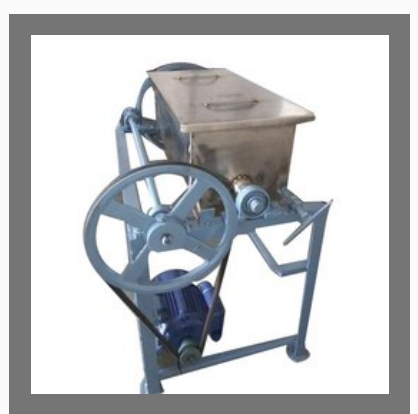
Dhoop Batti Powder Mixer Machine