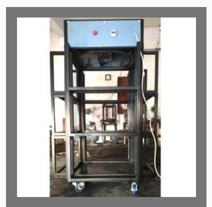
Automatic Incense Stick Dryer Machine