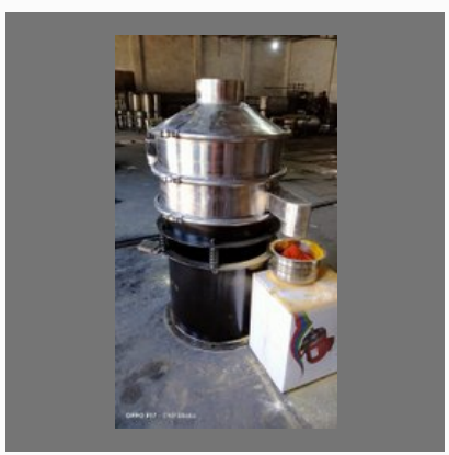
Stainless Steel Vibro Sifter