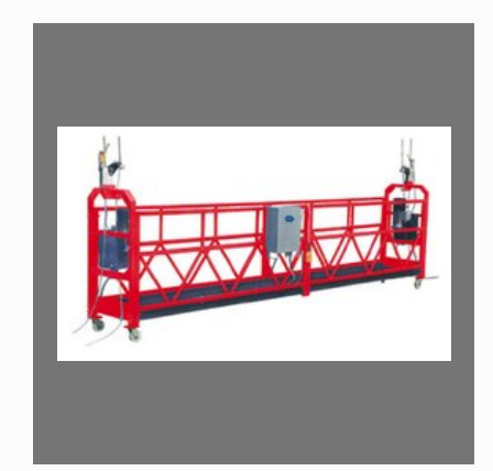
Rope Suspended Platform