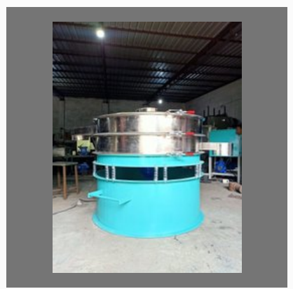
Stainless Steel Circular Gyro Screen Machine