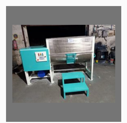
Pharma Powder Mixer Machine