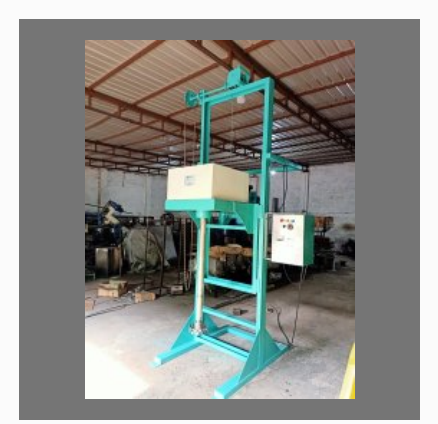
High Speed Electric Liquid Mixer Agitator Machine