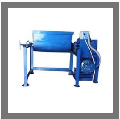
Semi Automatic Detergent Mixing Machine