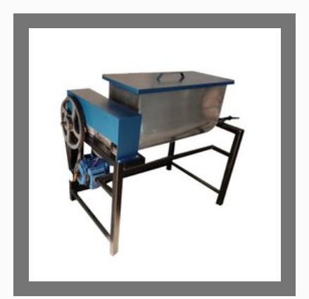
Incense Powder Mixing Machine