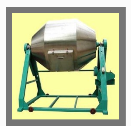
Tea Blender Machine