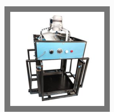
Incense Stick Hot Dryer Machine