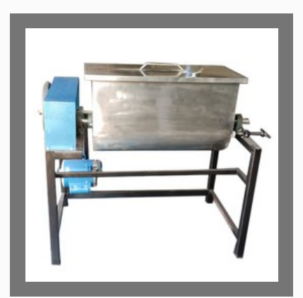
Stainless Steel Spice Powder Mixer Machine