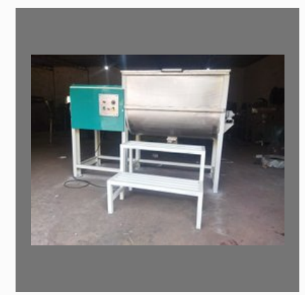
Ribbon Blender Machine