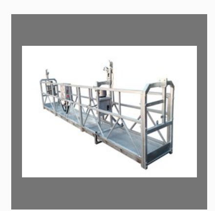
Stainless Steel Rope Platform