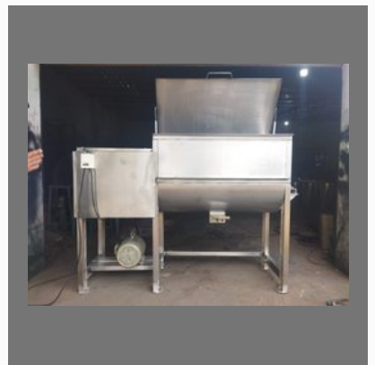
SS Ribbon Blender