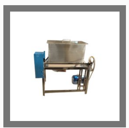
Tea Mixing Machine