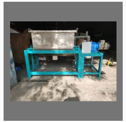
Semi Automatic Tea Blending Machine