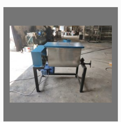
Agarbatti Powder Mixer Machine