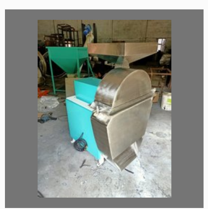
Detergent Cage Mill Machine