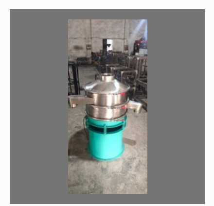
Vibro Screen Machine