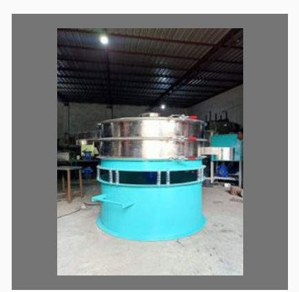
Automatic Stainless steel Sugar Mill Vibro Sifter, For Industrial