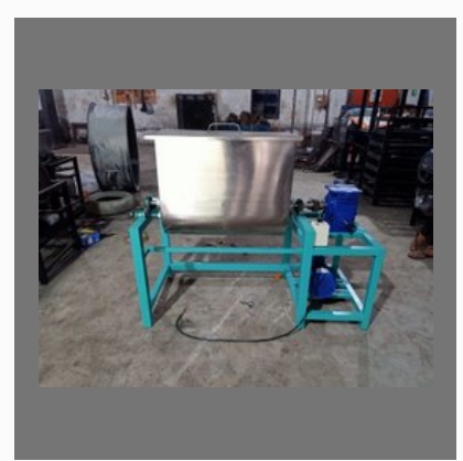
Detergent Powder Mixer Machine