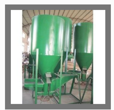
Detergent Powder Plant