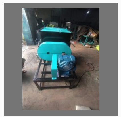
Detergent Cake Making Machine