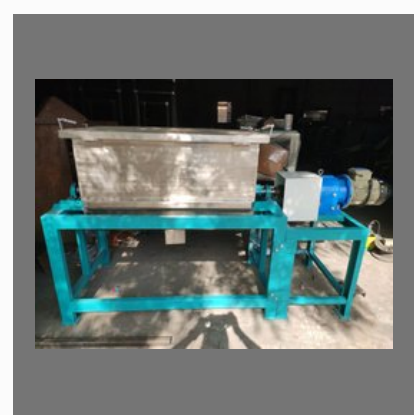
Ribbon Blender Machine