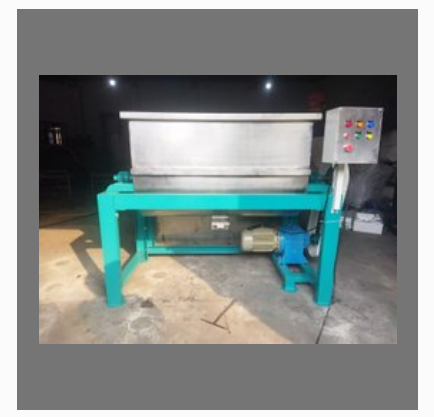
Ribbon Blender Mixer, Food, Pharma & Chemical Powder