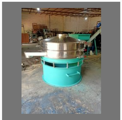
48" Vibro Shifter Machine