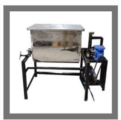
Semi Automatic Spice Powder Mixer Machine