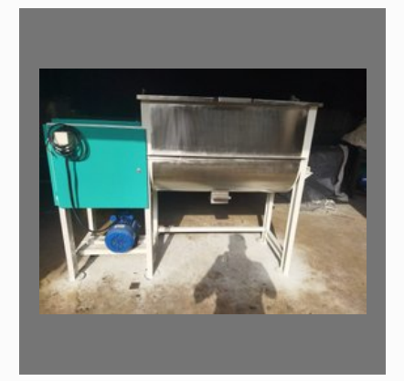
Detergent Making Machine