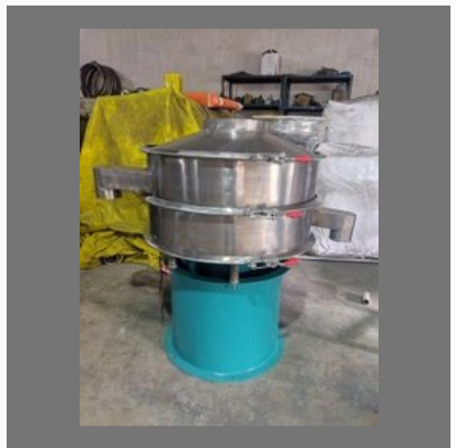
Compact Powder Sieving Machine