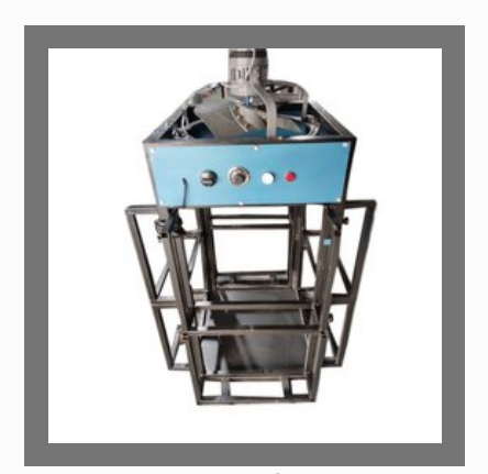
Electric Incense Stick Dryer Machine