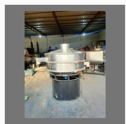
Vibro Sifter For Pharma Industry