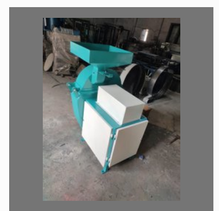
Detergent Powder Screening Machine