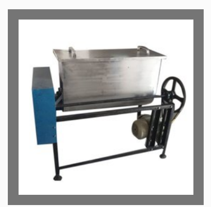
Washing Powder Mixer Machine