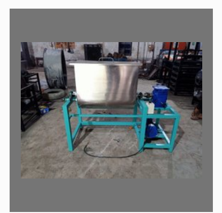
Dry Powder Mixer