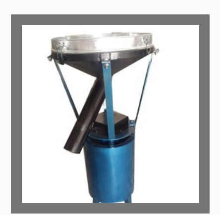
Powder Filter Machine